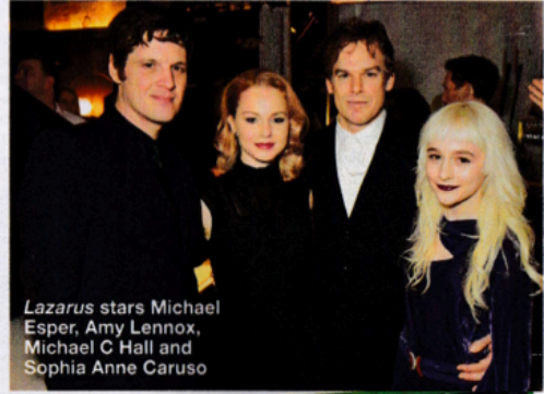
Lazarus stars Michael Esper, Amy Lennox, Michael C Hall and Sophia Anne Caruso