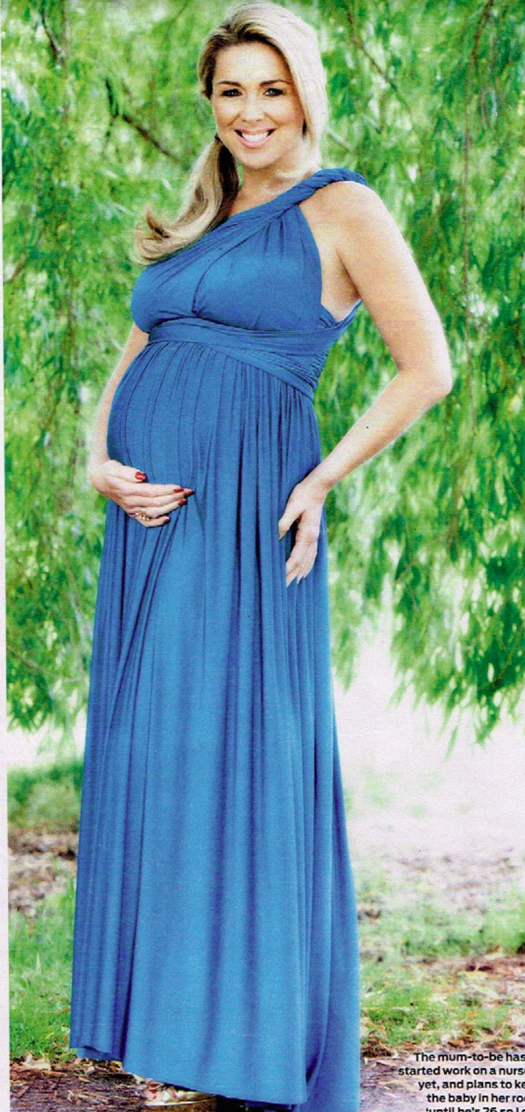
The mum-to-be has started work on a nursery yet, and plans to keep the baby in her room until he's 26 so I can

I'm getting so much grief off people because