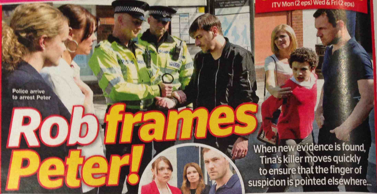
Police arrive to arrest Peter

CORONATION ST ITV Mon (2 eps) Wed & Fri (2 eps)