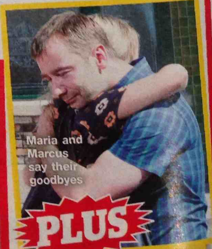
Maria and Marcus say their goodbyes

— he just can't see the inner turmoil that she's going through and doesn't suspect she's hiding anything at all.' However, all Andrea's efforts to conceal the truth have been in vain as when she and Steve have a drink to celebrate their course results, Neil walks in! Although she helps her cover her tracks, Michelle decides to confide in Steve and, devastated, he determines that Lloyd needs to know the truth. But how will he react?