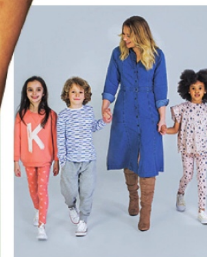
Above: As well as launching her kids' range (right), Kimberley is playing Claire Butterworth on Ackley Bridge and returning to the stage for a singing residency in London