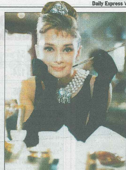
Audrey Hepburn starring as Holly Golightly