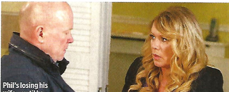
Phil's losing his wife... again

Phil and Ronnie worry that Sharon's got on the wrong side of Vincent when they're unable to find her, and are in for a shock when she returns home with Gordon in tow. Will the hairy biker be sticking around?