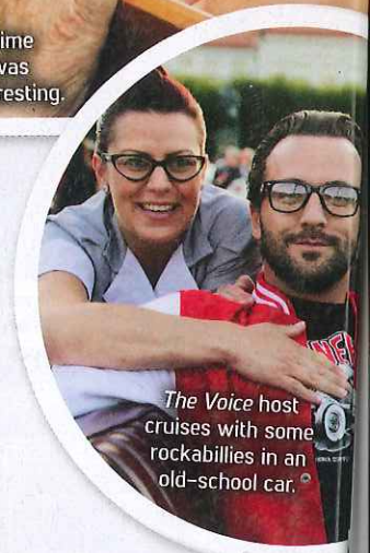
The Voice host cruises with some rockabillys in an old-school car.