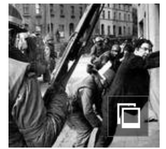
The Troubles gallery - John Hume detained in 1971