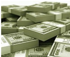
Little Known Way To Pay Off Mortgage Daily Mortgage Monitor