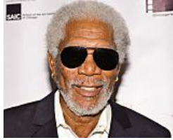
8 Celebs Who Have Severe Illnesses PressroomVIP