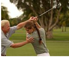
The #1 Reason the Average Golfer Can't Break 90 (or even 100)... Revolution Golf