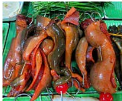
Top 10 Cancer Causing Foods You Eat Every Day NaturalON

COMMENT RULES: Comments that are judged to be defamatory, abusive or in bad taste are not acceptable and contributors who consistently fall below certain criteria will be permanently blacklisted. The moderator will not enter into debate with individual contributors and the moderator's decision is final. It is Belfast Telegraph policy to close comments on court cases, tribunals and active legal investigations. We may also close comments on articles which are being targeted for abuse. Problems with commenting? customercare@belfasttelegraph.co.uk