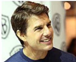
Tom Cruise's Jaw-Dropping Admission Is Scientology's Worst Nightmare Stirring Daily