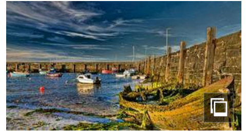
Reader's favourite Ulster beauty spots