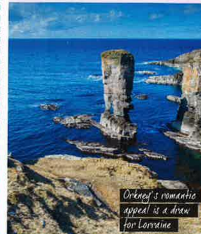
Orkney's romantic appeal is a draw for Lorraine

Orkney is one of those places where, if you go once, you need to return again and again. I could see myself living there and writing novels - but not just yet. I'm talking years in the future here!