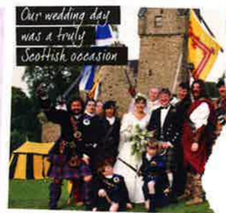
Our wedding day was a truly Scottish occasion