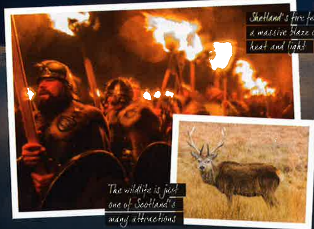
Shetland's fire festival - a massive blaze of heat and light

The Commonwealth Games, the big vote on independence... Scotland is the place to be this year. But for some it's always at the heart of things - as Lorraine Kelly tells us