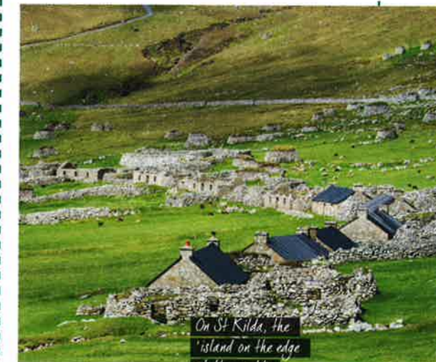
On St Kilda, the 'island on the edge of the world'