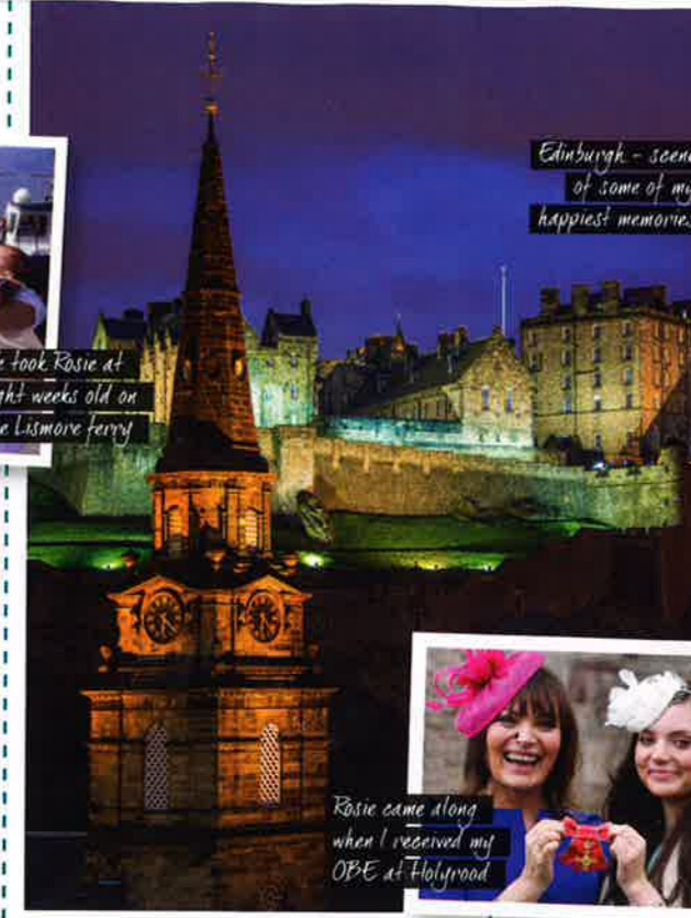
Edinburgh - scene of some of my happiest memories