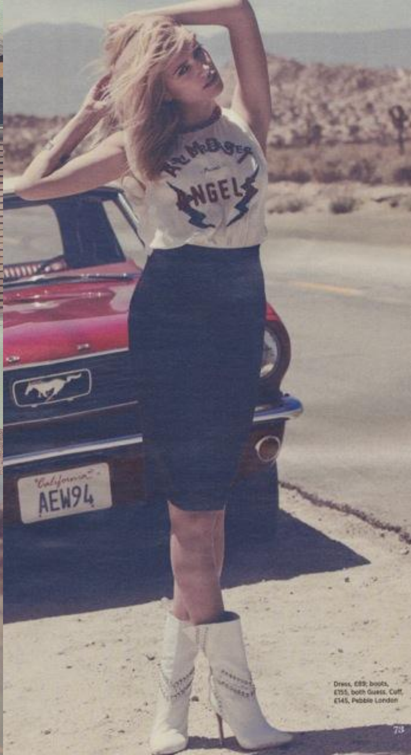
Dress, £89; boots, £75; both Guess; Cuff, £145; Pabbie London