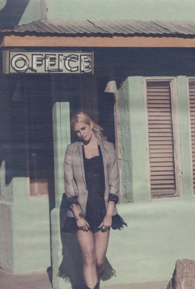
Dress, £115; top, £75; coat, £90; shoes, £120; boots, £120; The Fry Company