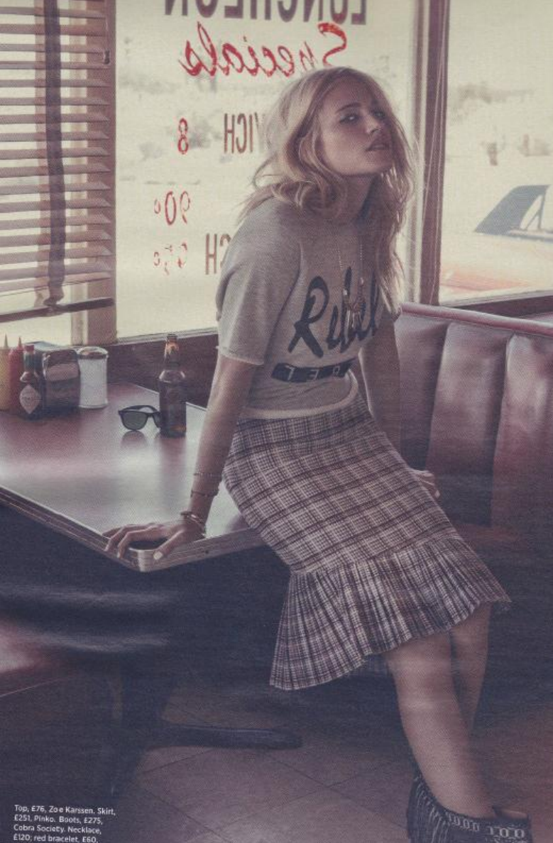
Top, £76, Zoe Karssen. Skirt, £251, Pinko. Boots, £275, Cobra Society. Necklace, £120, red bracelet, £60.