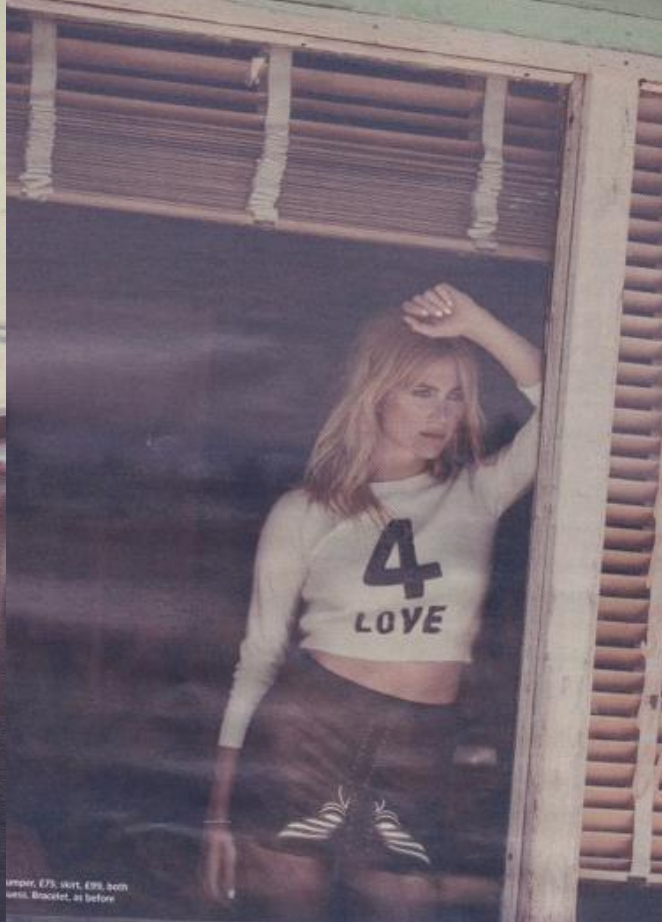
Top, £75, skirt, £99, both west. Bracelet, as before