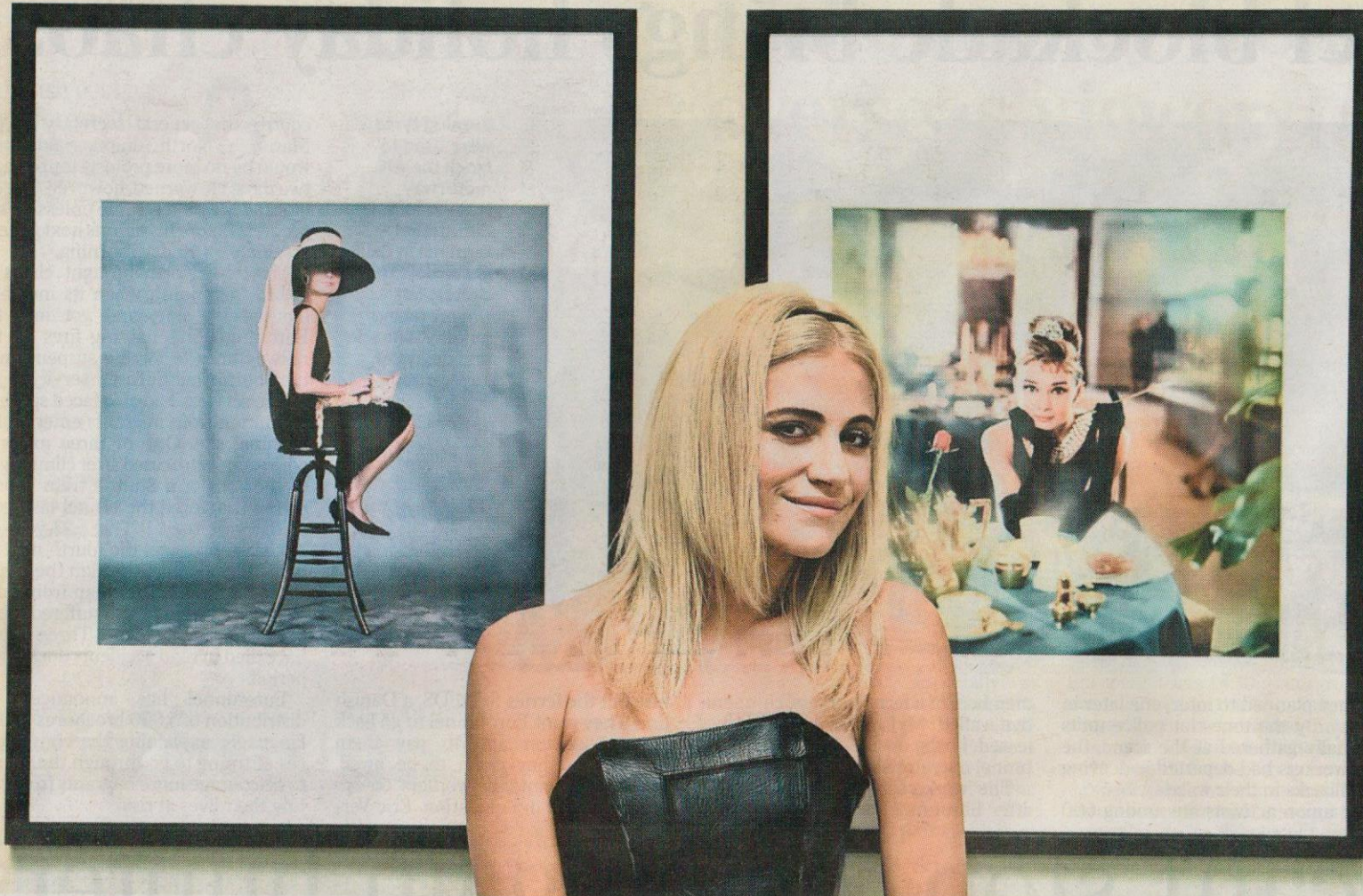
New romantic Pixie Lott at the Audrey Hepburn exhibition at the National Portrait Gallery. She will play Holly Golightly in the stage version of Breakfast at Tiffany's